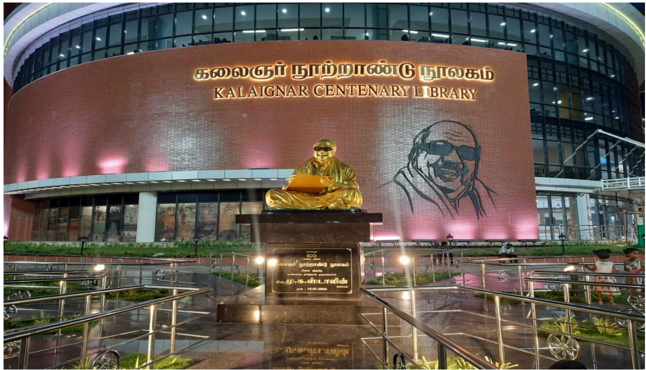
Picture of Kalaaignar Centenary Library