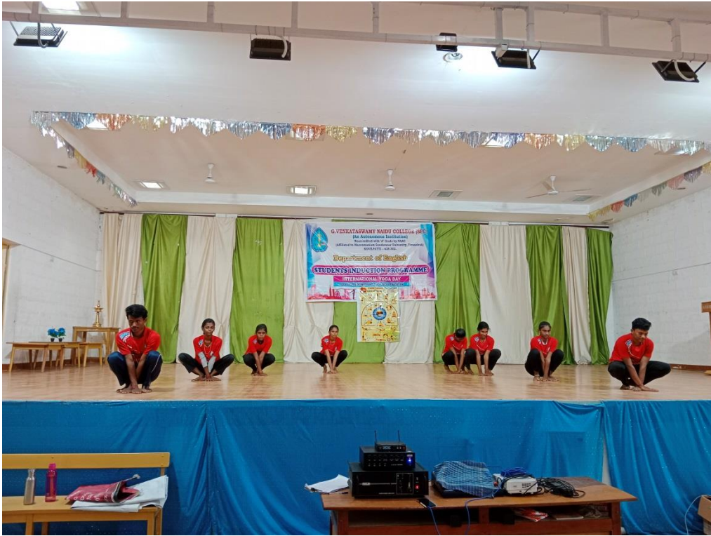
The Yoga demonstration by our students