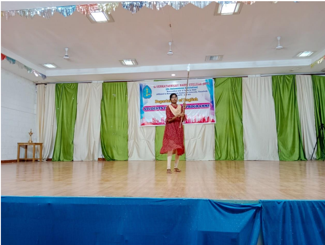
A girl exhibit her talent during the final day of the Students Induction Program

Following the session, students were encouraged to showcase their talents in a variety of areas, including music, dance, drama, visual arts, and more. The performances provided a platform for students to express themselves and share their unique abilities.