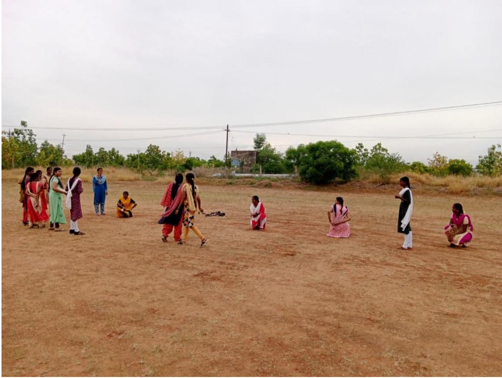
Girls during the Game Session