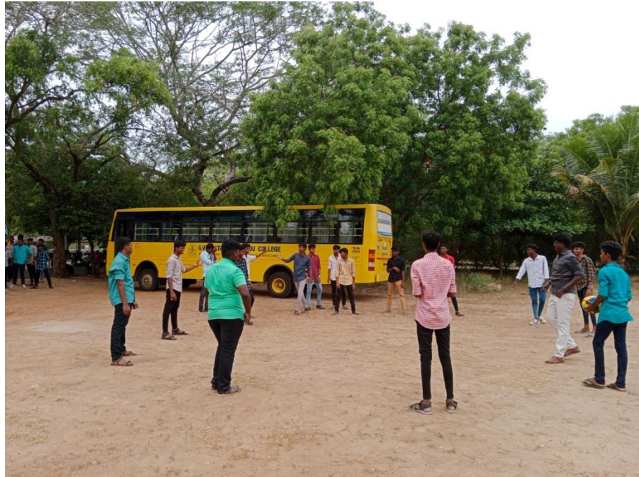
Boys during the Game Session

Fourth Day of the Induction Program 22-06-2023