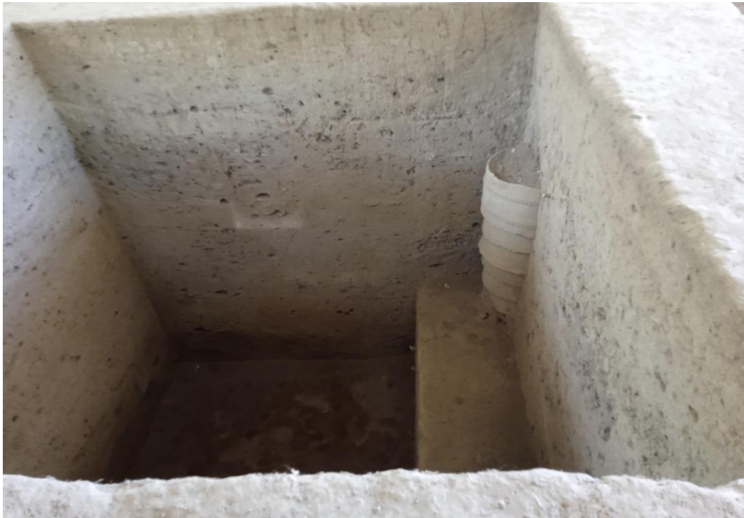
A Pit in Keeladi Archaeological Site

On September 12, 2023, a group of 45 enthusiastic students and 12 faculty members embarked on an educational excursion to the Keeladi Archaeological Site, located in Tamil Nadu, India. The visit aimed to provide an immersive learning experience about the rich historical and cultural heritage of the region