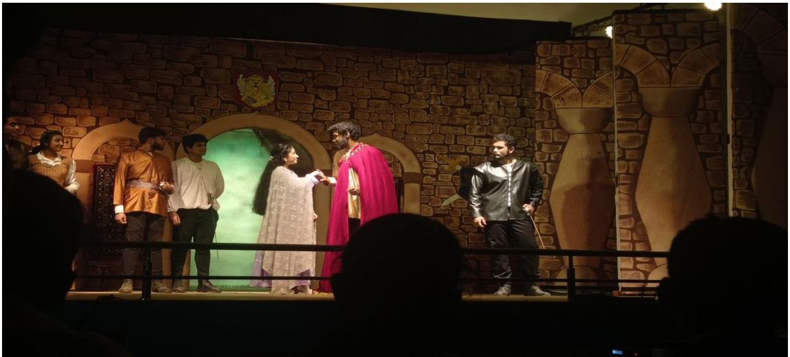
A Scene in the play Othello

Following the wonderful site we proceeded to a live performance of William Shakespeare's "Othello" at American College and to explore the vast literary resources at the Kalaignar Centenary Library in Madurai. The visit aimed to provide students with a unique blend of cultural enrichment and academic exploration. The performance of "Othello" was a cultural feast for the senses, immersing students in the world of Shakespearean drama and storytelling