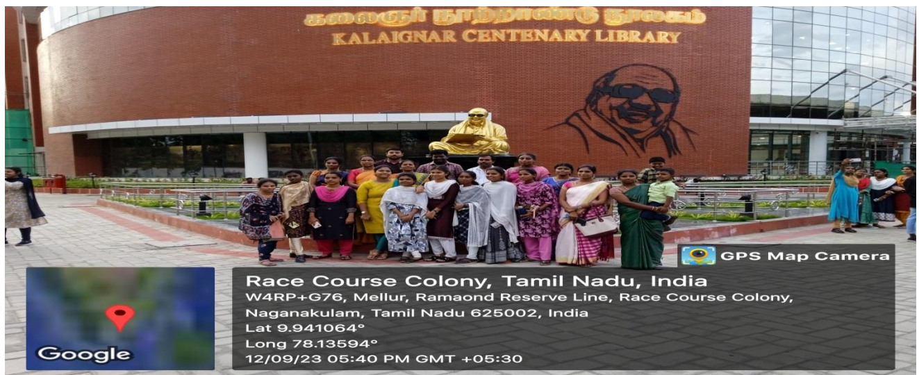
Faculties with II M.A Students before Kalaaignar Centenary Library